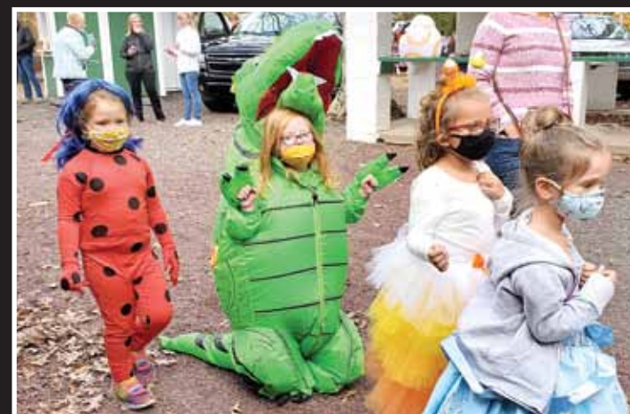
St. Jude School Pre-K classes are the first to arrive at the trunk or treat held at St. Jude School.