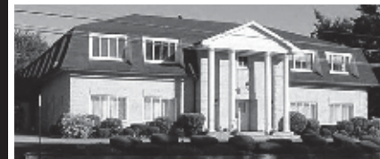
Parking for 100 vehicles

436 S. Mountain Blvd., Mountain Top Next to St. Jude Church