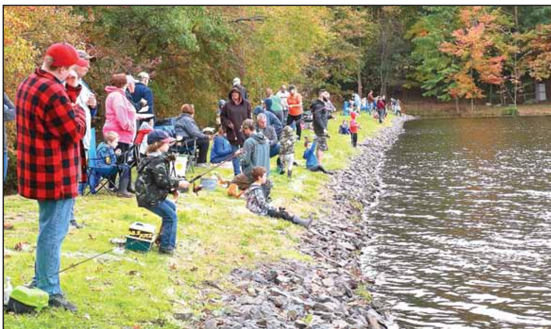
Fall colors provide a beautiful backdrop for the annual children's fishing derby at Blytheburn Lake.

This year 102 trout were released for the derby and more than 35 kids came to the lake to try their hands at catching a big trout.