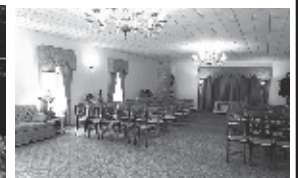
Two large visitation rooms

Serving your family with dignity, compassion and care