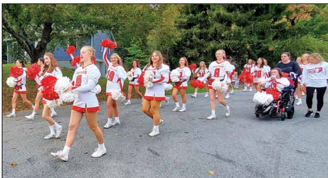
The Comets cheerleaders spark the crowds along the 2021 Homecoming parade route.