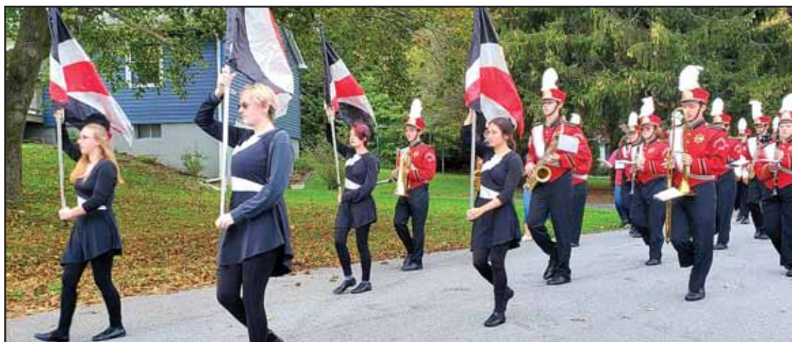
The Color Guard was in the lead as the 2021 Crestwood High School Homecoming parade started to make its way on South Main Road.