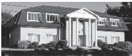
Parking for 100 vehicles

436 S. Mountain Blvd., Mountain Top Next to St. Jude Church