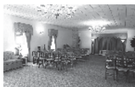
Two large visitation rooms

Serving your family with dignity, compassion and care